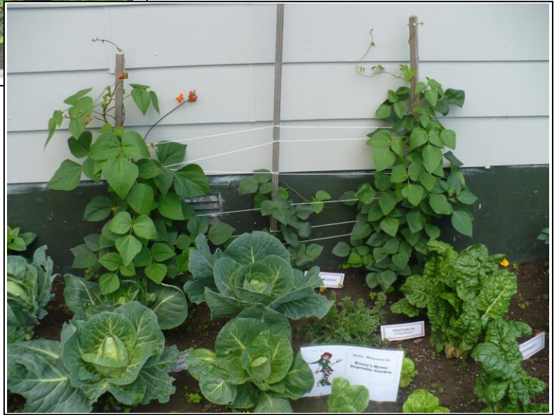
The start of Zach Snushall's latest exciting story...